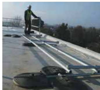
KeeGuard® FoldShield Folding Safety Rail System Maintain building aesthetics with cantilevered and foldable guardrail.