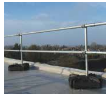
KeeGuard® Contractor Upright, Weighted Guardrail Modular safety rail provides a secure barrier around tight areas. Free-standing and portable for temporary installations.