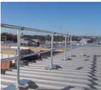
KeeGuard® TopFix Metal Roof Perimeter Protection A smart solution for standing seam and metal profile roof systems.

STANDING SEAM | METAL PROFILE | MEMBRANE | COMPOSITE | GREEN ROOF